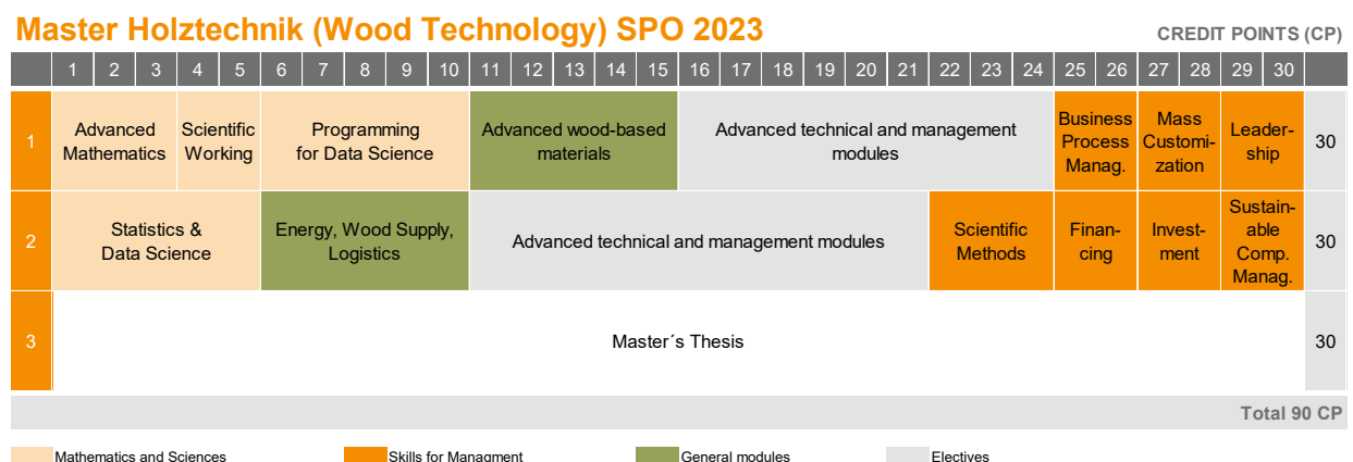
Fig. 2: Schematic representation of the detailed Programme structure